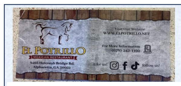
8465 Holcomb Bridge Rd, Alpharetta, GA

Join us for dinner before our meetings! Some members go to Hooligans Restaurant (behind the CVS) 8440 Holcomb Bridge Rd, Roswell 5:00pm. Recently, due to the size of the crowd and slower service, some members are enjoying the Mexican cuisine at the restaurant in the strip mall across the street from Woodcraft. Wherever you decide: enjoy a good meal and most importantly, the fellowship with other members.