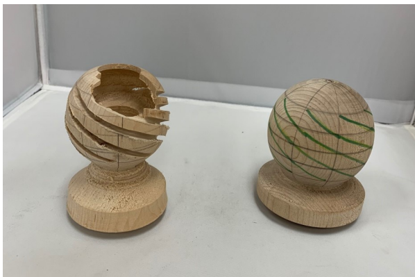
The blank on the right hasn't had the grooves added yet. The blank on the left shows what the results of a catch are. You can see the extent of the hollow forming work and how the grooves are cut in this piece.