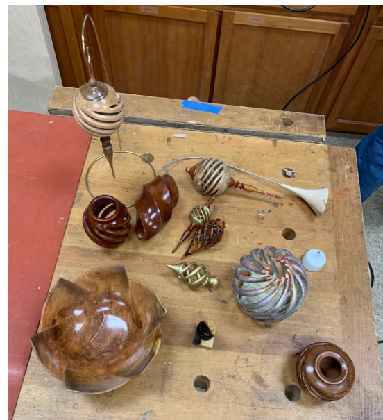
Here are some examples of Walt's spiral hollow forms and variations of segmented pieces.