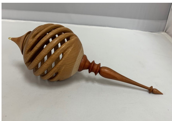
Here is an example of a spherical spiral hollow form with an end cap and finial. These can be produced as hanging ornaments