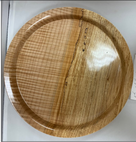
Kim Muthersbough– Flat Spinning Top Corral Platter, Figured Maple, Liberon Finishing Oil