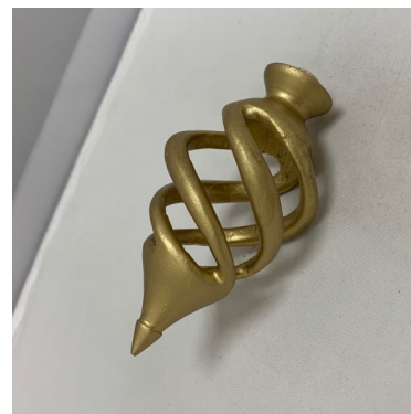
This piece is more cylindrical / elongated in shape than the spherical units. It also has a much wider groove cut between ribs.