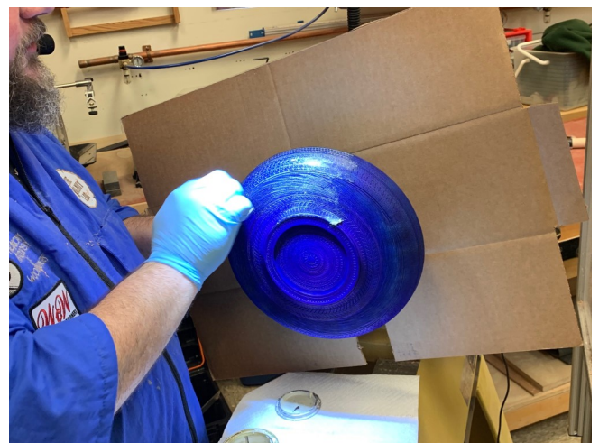
Liming wax is applied after the dye has dried. When buffed