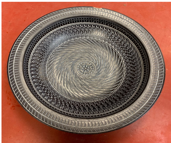
Another example of a previously turned bowl