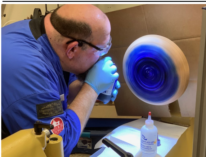
Dying the textured surface on the lathe enables work to flow smoothly