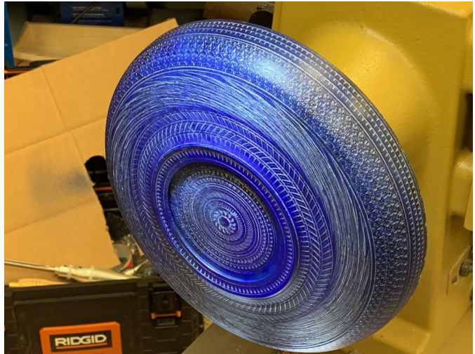
Outside of the bowl completed