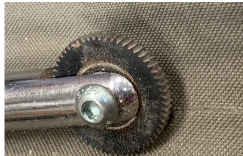
Close up view of texturing tool