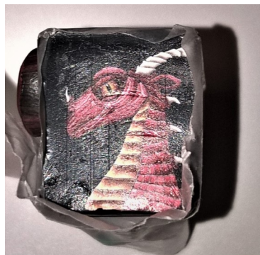
An end view of a custom cane containing the profile of a dragon