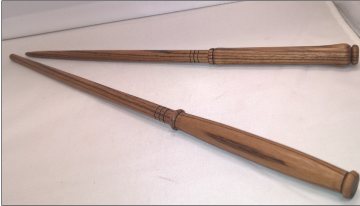
Victoria Skye— Magic Wands, Zebra Wood, Shellac