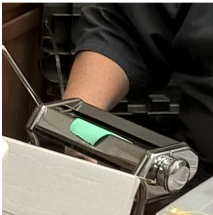
A piece of polymer clay exiting the roller

If it looks like a pasta roller, well.... It might be. Peggy uses the roller to size the material to the desired thickness before applying it to the object. Once rolled the clay can be trimmed with a knife to match a shape or the profiled object in a cane slice.