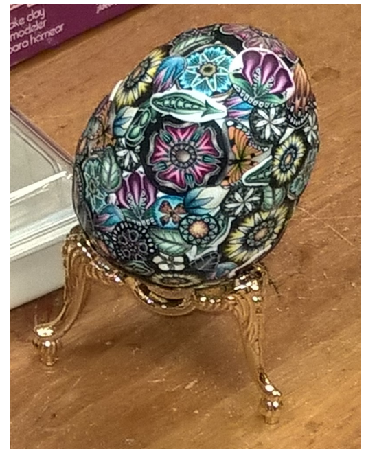
An example of the finished decorated turned egg. You can see the individual cane slices applied over the base coat and overlapping adjacent sections.