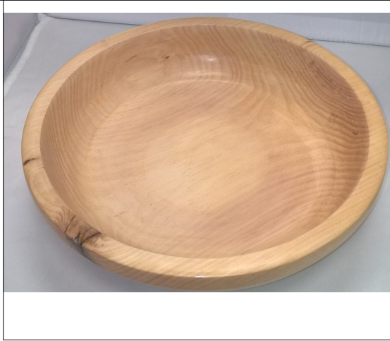
Reese Haren—Cabrio, Pine, Wax buff