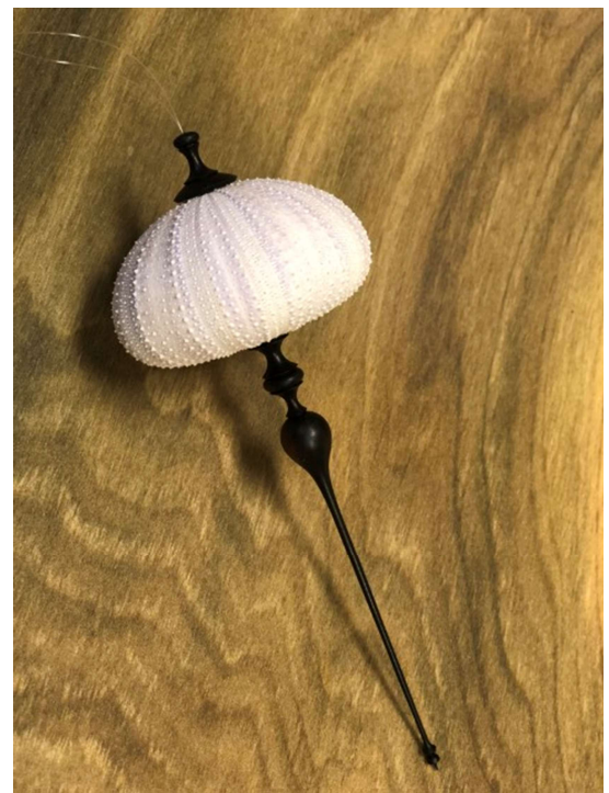
Finally, a couple of pictures of the finished work. The ornament is resting on the platter Ashley brought (the same one Hans is holding on the previous page). The gouge shown on page 5 was used to perform the very fine spindle turning on page 7, resulting in the finial and cap on the ornament above.