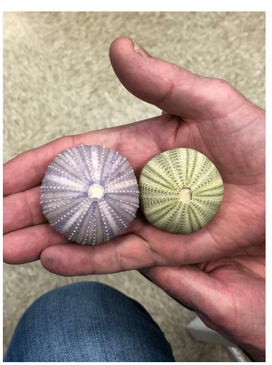
Pictured above are the shells that have been drilled and filled as preparation for the ornament assembly