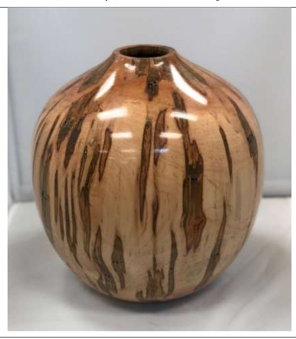
Kevin Wood, Hollowform, Ambrosia Maple, Oil/Shellac/General Finish High Performance Gloss