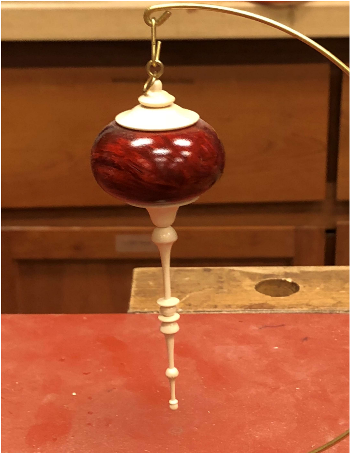
Hanging ornament with finial