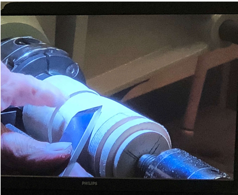
Turning the body section (lower right)