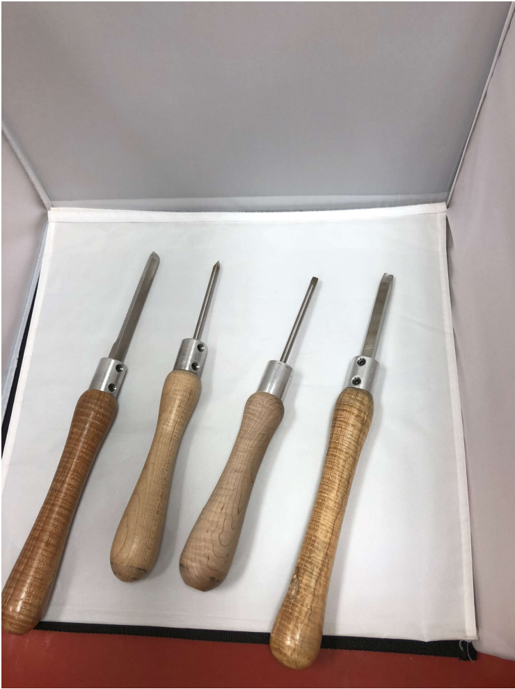
Some of Alan's tools (left)