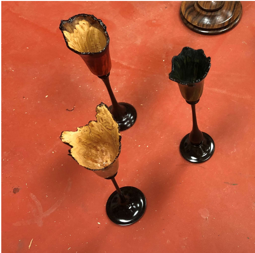
Live Edge style thin wall goblets on stems