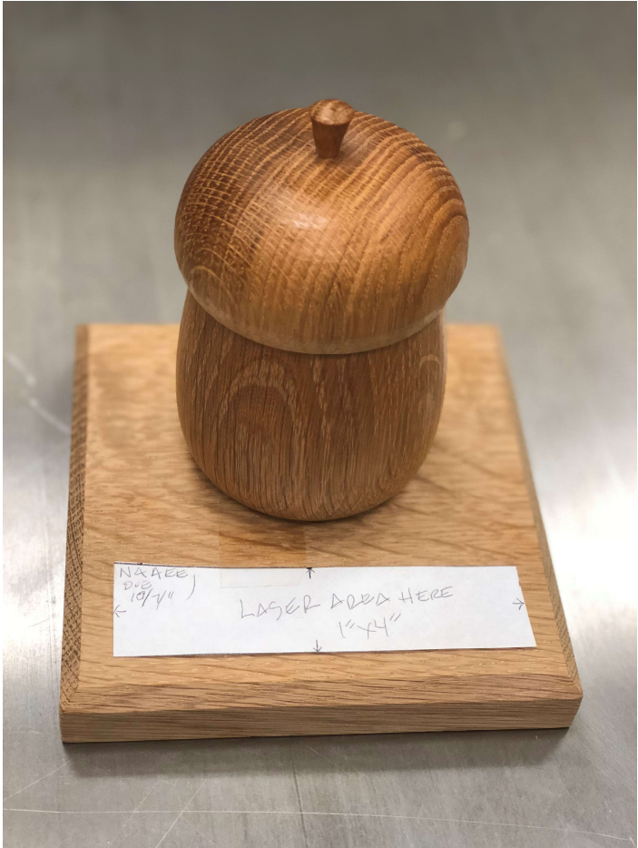
Lidded box sample on a base