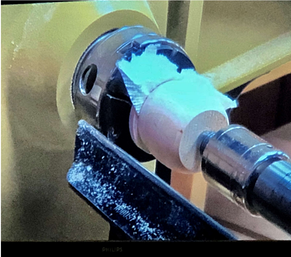
Setting a box top onto a jam chuck for finish turning