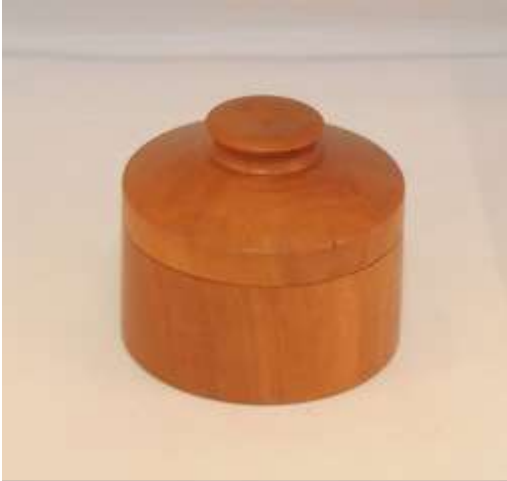
Bruce Fairchild: lidded boxes