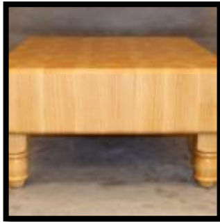
Steve Quehl - maple butcher block table