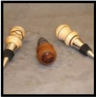
Oliver Buettner - Maple & Walnut with Cocobolo inlay