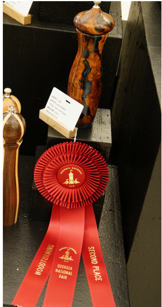
Leslie Ballard - 2nd Place - Functional