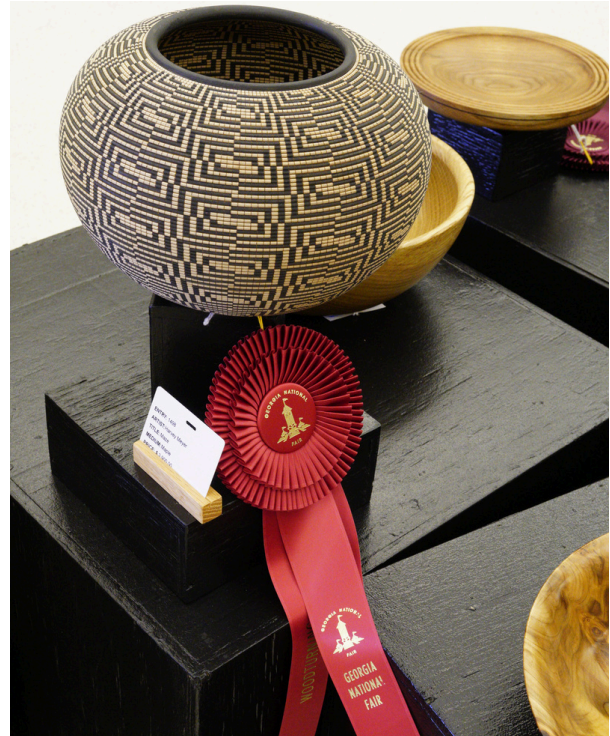
Harvey Meyer - 2nd Place - Vessels