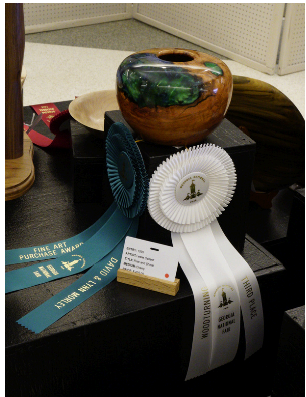
Leslie Ballard - 3rd Place - Hollow Form