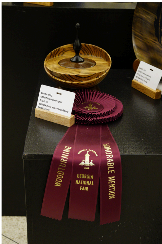
Blake Cherrington - Honorable Mention - Bowls