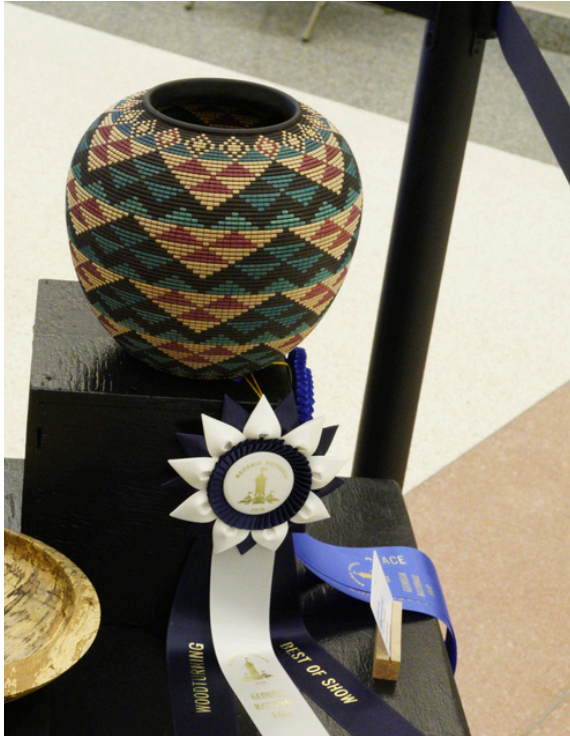
Harvey Meyer - 1st Place, Best of Show - Vessels

Did y'all know we're in the presence of woodturning greatness?