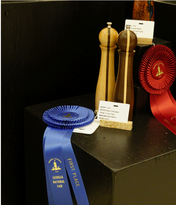
Blake Cherrington - 1st Place - Functional

Did y'all know we're in the presence of woodturning greatness?