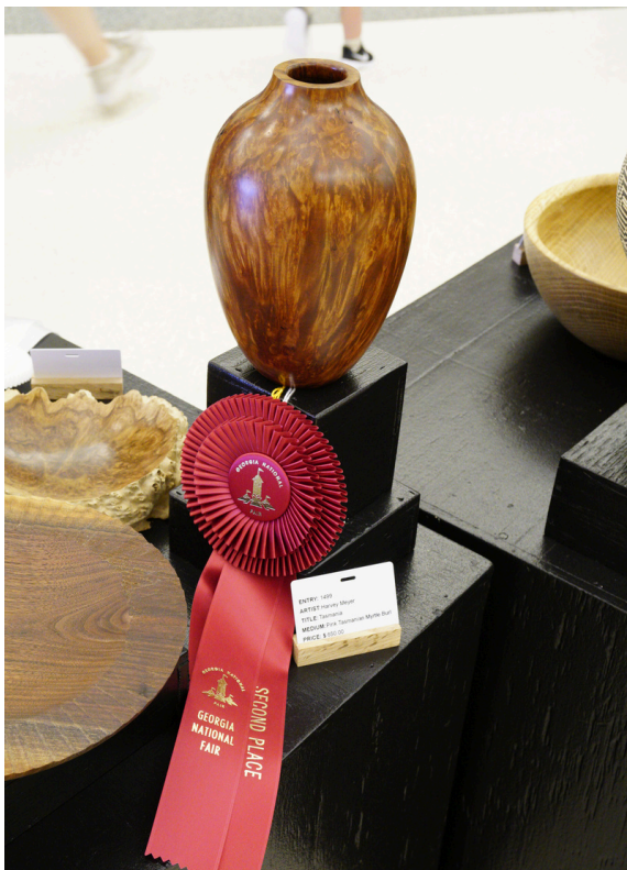
Harvey Meyer - 2nd Place - Hollow Form